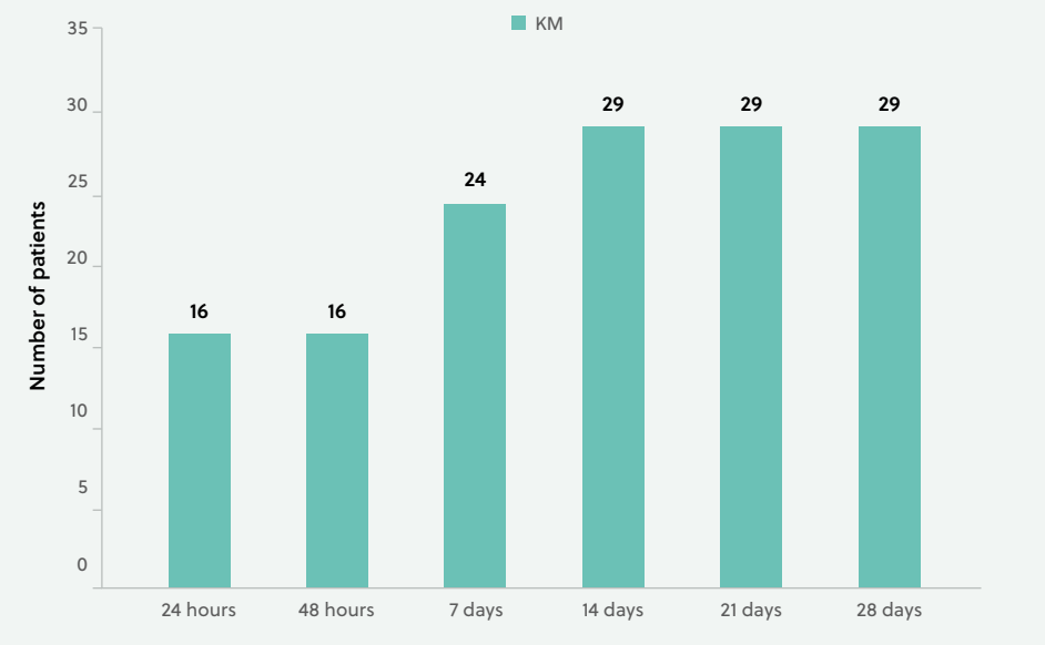
FIGURE 2. KM Monitoring Time Needed to Detect Recurrent AF in Post-Ablation Patients